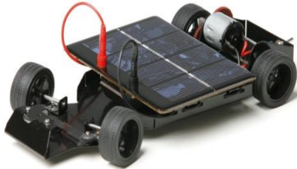
Solar Cell Car