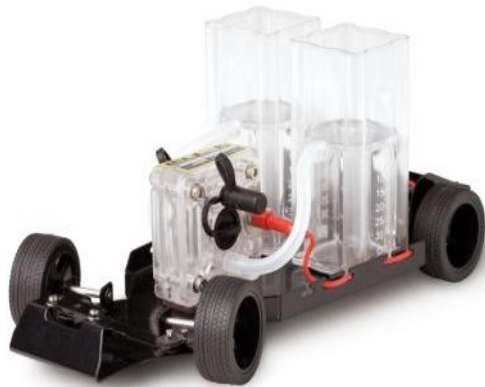
Fuel Cell Car (H 2 /O 2 )