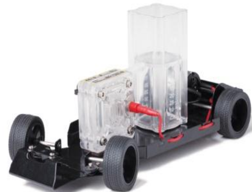
Fuel Cell Car (H 2 /Air)